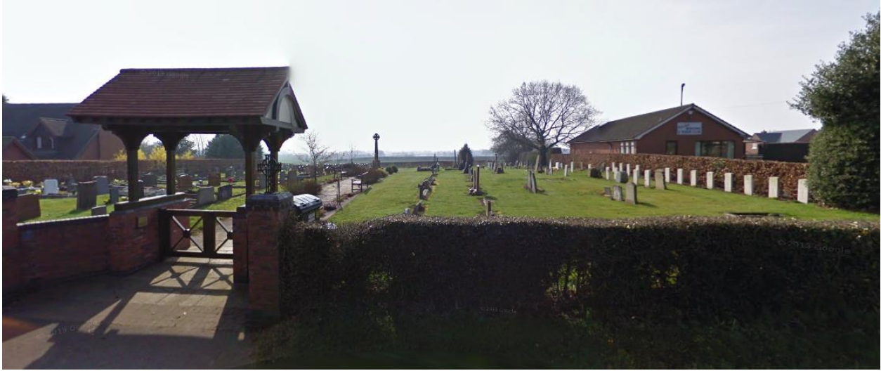
Christ Church Churchyard Extension, Tilstock, Shropshire

Photo of Second Lieutenant R. J. T. Forsyth's Commonwealth War Graves Commission Headstone in Christ Church Churchyard Extension, Tilstock, Shropshire, England.