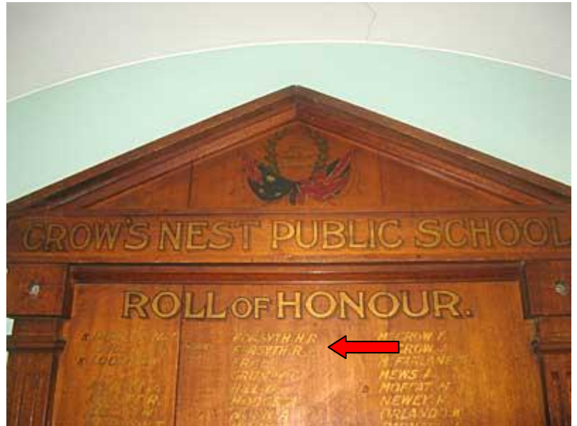
Crow's Nest Public School Roll of Honour