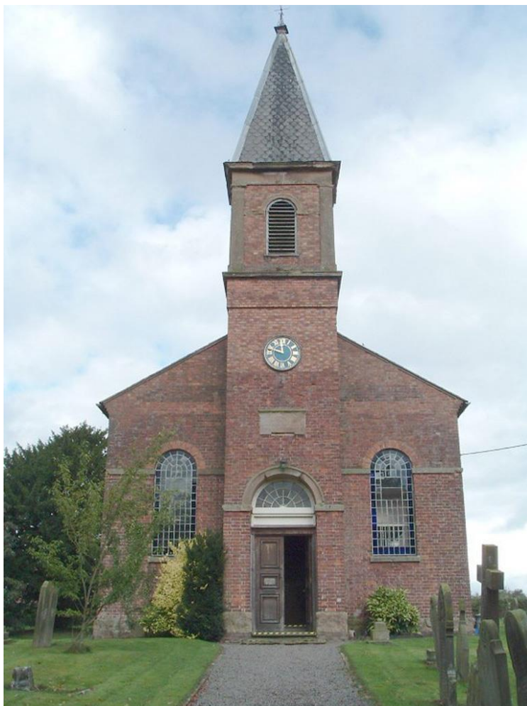
Christ Church, Tilstock, Shropshire

There are 22 Commonwealth burials of World War 1 in the churchyard. There are a further 23 Commonwealth burials of the First World War in the Extension. The Extension is 100 metres from the Churchyard and across the road. It was opened in 1917.