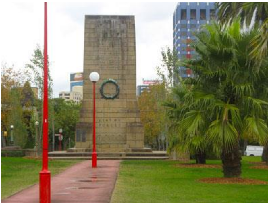
North Sydney War Memorial